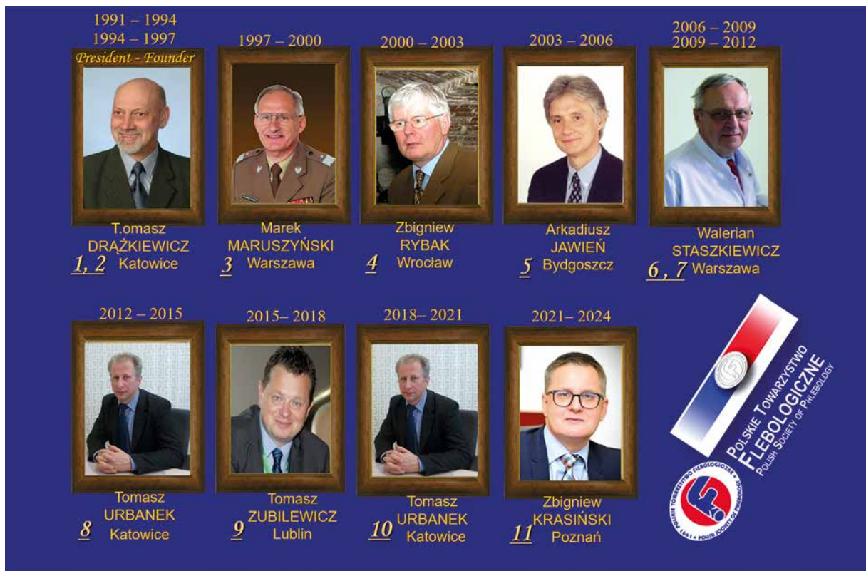
Fig. 9. Presidents of the Polish Society of Phlebology from the 1 st (1991–1997) to the 11 th (2021–2024)