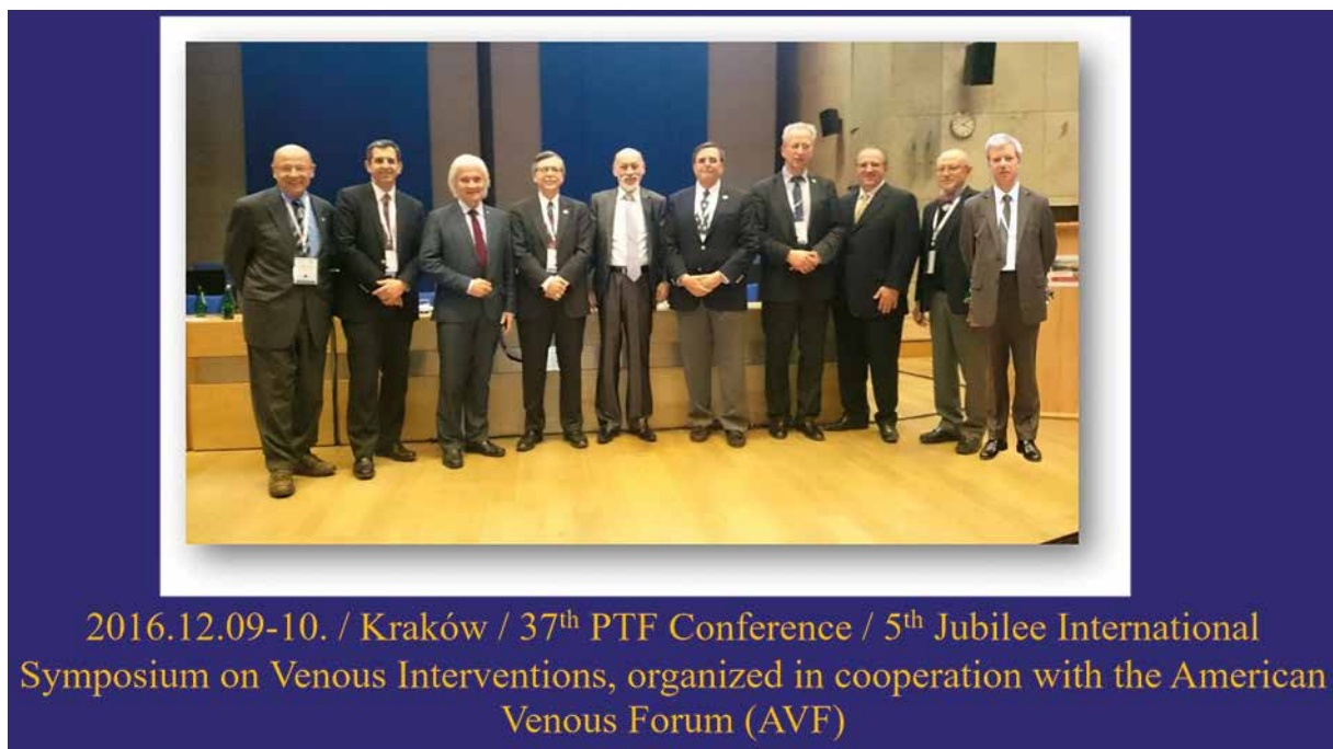
Fig. 6. 37 th PTF Conference/5 th Jubilee International Symposium on Venous Interventions, 09–10.12.2016, Kraków (PL), organized by Polish Society of Phlebology in cooperation with American Venous Forum