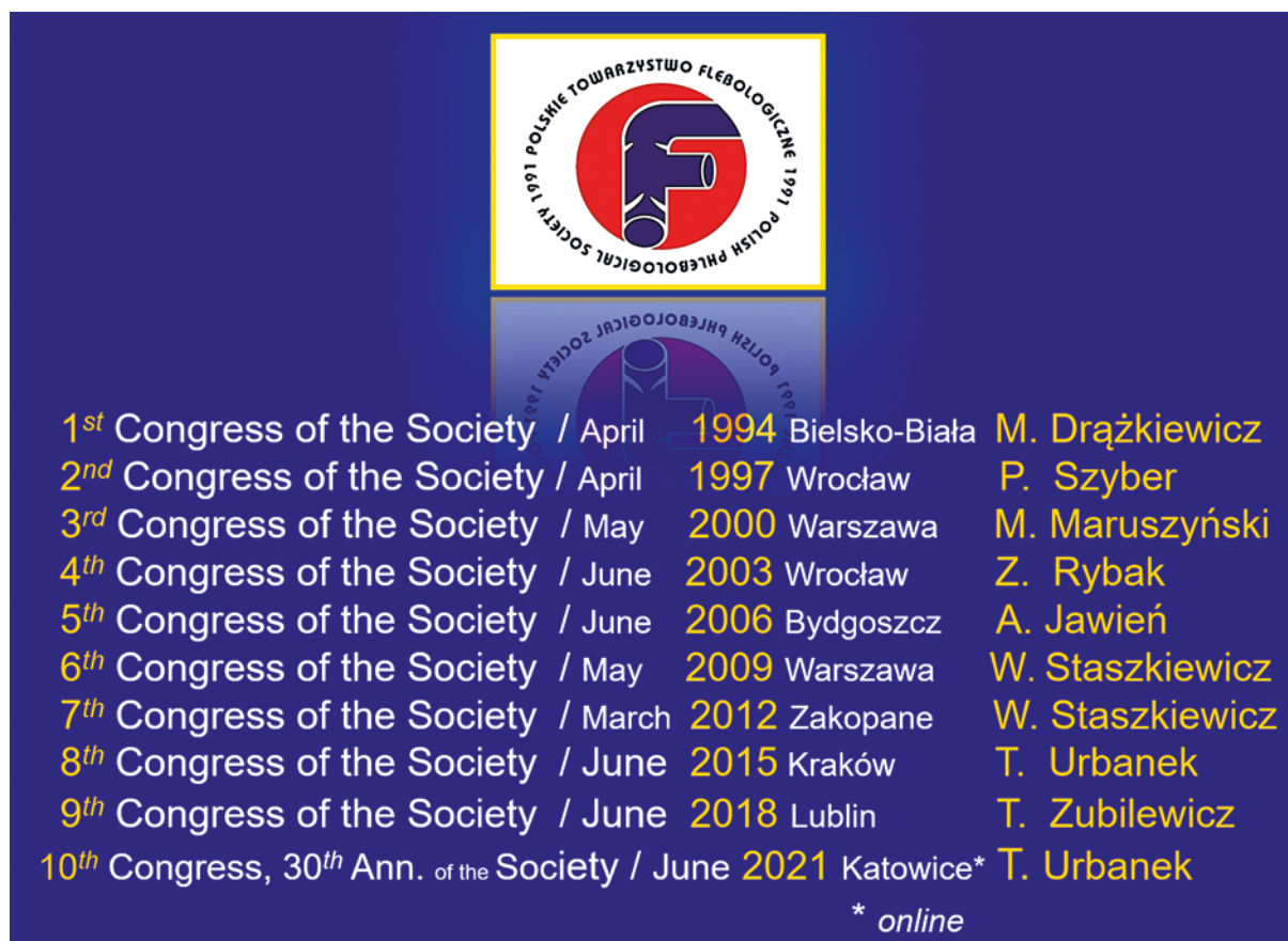
Fig. 8. Congresses of the Polish Society of Phlebology from the 1 st (1994) to the 10 th (2021)

2020.12.12–13, Katowice (Poland) – 47 th PTF Conference/8 th International Symposium on Venous Interventions. Focus on chronic venous insufficiency (online).