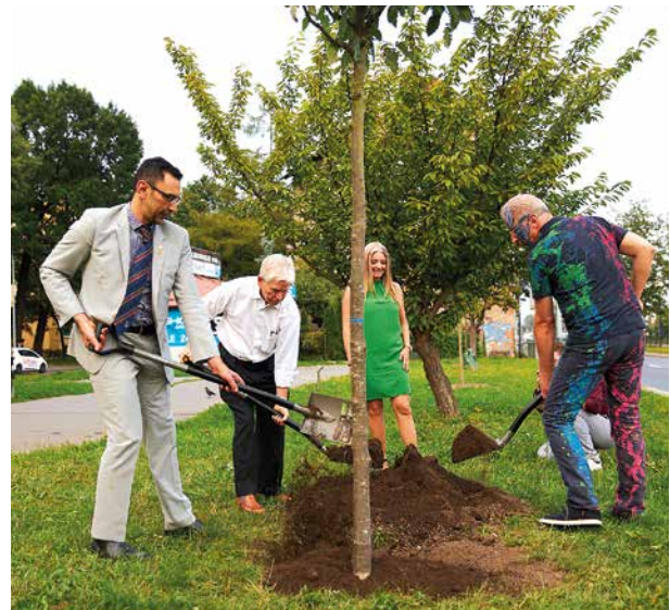
Fig. 7. Union Internationale de Phlébologie Chapter Meeting – UIP 2019 Tree (Swedish Whitebeam/ Sorbus intermedia ), 2019, Kraków (PL)

A nice, pro-ecological event took place during the congress. A symbolic tree was planted to celebrate this event – it was named the UIP 2019 Tree (Fig. 7).