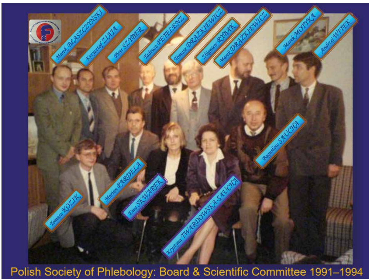
Fig. 2. Polish Society of Phlebology, 25.11.1992, Katowice (PL). Management: Board and Scientific Committee (1991–1994)