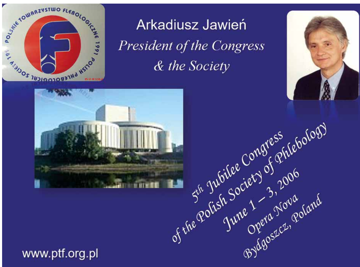
Fig. 5. 5 th Jubilee Congress and 15 th Anniversary of the Polish Society of Phlebology, 2006, Bydgoszcz (PL). Chairman: A. Jawień

2006.06.03 – General Assembly of Members. Election of the authorities for the 6 th term of office PTF, 2006–2009.